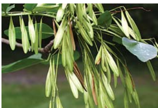
*Paul Wray, Iowa State University

Identifying ash trees by their bark is difficult. Use this in combination with other indicators.